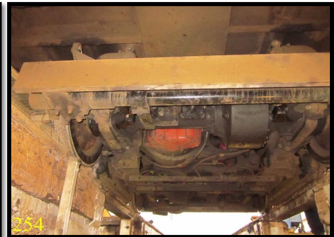
Truck Under Car